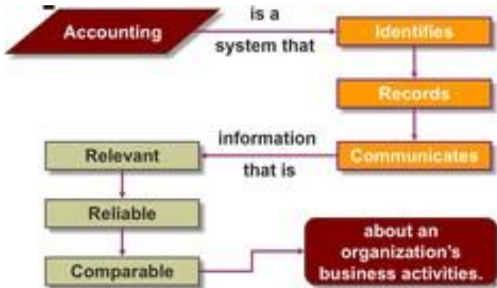
Gambar 1.1: System Information of Accounting

Accounting is the systematic and comprehensive recording of financial transactions pertaining to a business, and it also refers to the process of summarizing, analyzing and reporting these transactions to oversight agencies and tax collection entities. Accounting is one of the key functions for almost any business; it may be handled by a bookkeeper and accountant at small firms or by sizable finance departments with dozens of employees at large companies.